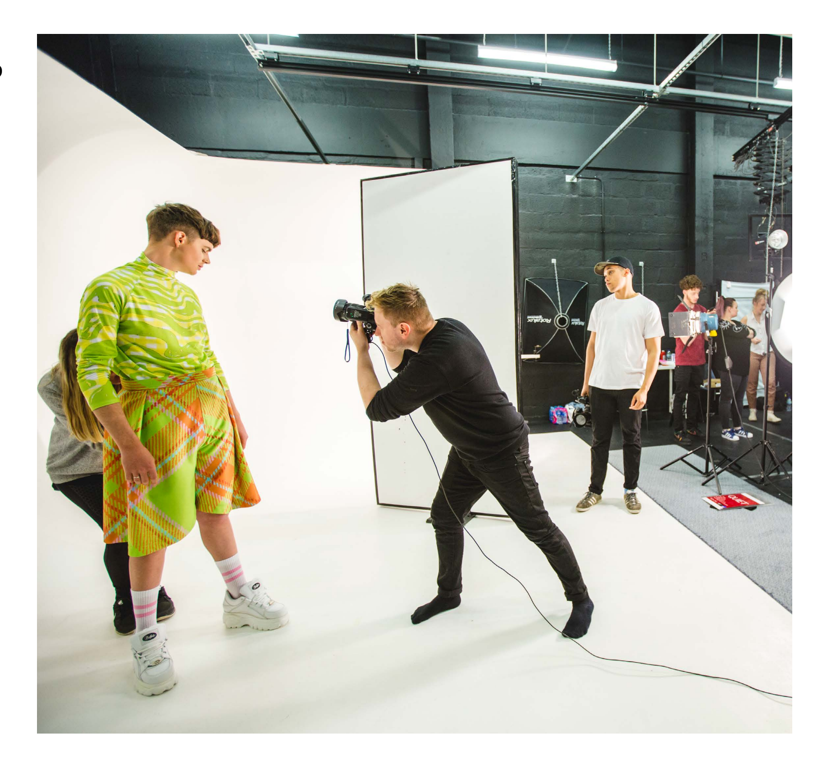
Image: Students have access to industrystandard facilities across campus, encouraging interdisciplinary collaboration.

Founded in 1856 as the Plymouth Drawing School, the University offers a comprehensive spectrum of specialist undergraduate, postgraduate and pre-degree study in Arts, Design and Media – combining over 165 years of creativity with contemporary thinking and cutting-edge, industry standard resources.